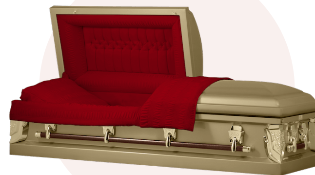
Cambridge Series Steel