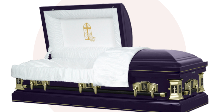
Unique: Religious Specialty / Steel