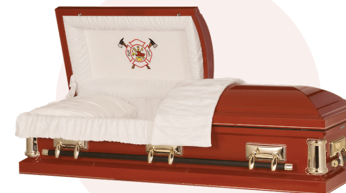
Unique: Firefighter Specialty / Steel