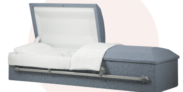
Cloth Series Eco-Friendly

Call us now 501.420.3990 or visit at titancasket.com . Questions? We are here to help, 7 days a week.