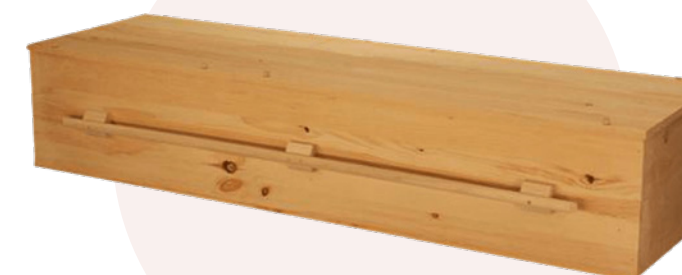
Wood Series Eco-Friendly