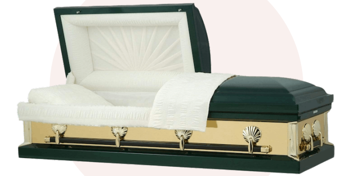
Reflections Series Steel