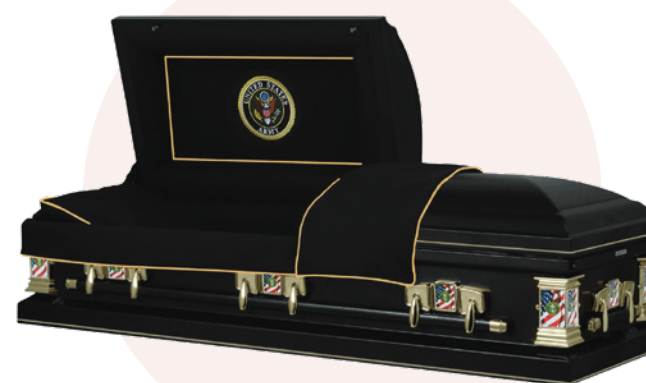
Veteran Select Military