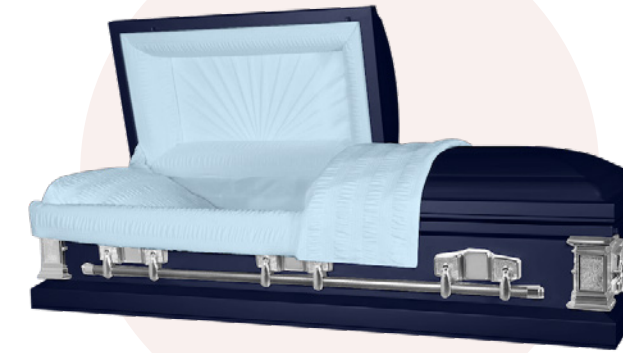
Satin Series Steel